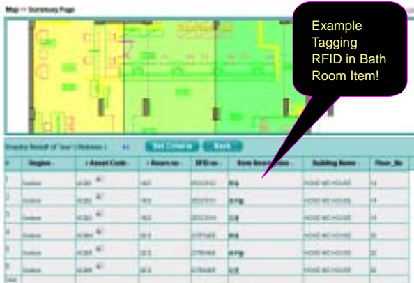
VHFMS™ – Support for RFID

With the support of handheld RFID or barcode device, VHFMS is able to handle routine health checking on assets and furniture, as well as to create new works order with appropriate order items which can be forwarded to contactors or consultants immediately. Hence, contactors and consultants can view the exact work location via the drawings management module of VHFMS and obtain the accurate corresponding works order information simultaneously.